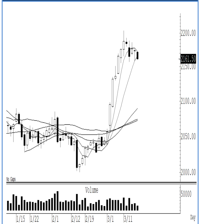
GOH24 (Close 2,161.50 Chg -12.60)

ราคาทองคำโลกย่อตัวลงจากแรงขายทำกำไร เราแนะนำยกการ์ดสูงหรือตั้ง stop ไว้ จากความผันผวนของราคาที่เราคาดว่าจะแกว่งแรง แนะนำ trading ในกรอบ 2,172-2,140 ดอลลาร์ รับรู้กำไร ในกรณีที่ปิดต่ำกว่าระดับ 2,135 ดอลลาร์ แนะนำ ถือ short หวังผลปรับตัวลงไปแถว ๆ 2,070 ดอลลาร์ รับรู้กำไร